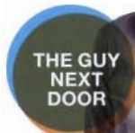
THE GUY NEXT DOOR

A relationship is built on a number of things, trust and respect being a major part – trust that each will do right by the other and respect for the other as an individual. How we treat each other is a reflection of the respect we have. It seems you have done damage to both these principles. I suggest you put your pride aside and try being honest with him. If he does decide to take you back, work on being a better girlfriend and realise that a relationship is hard to keep, and easy to lose.