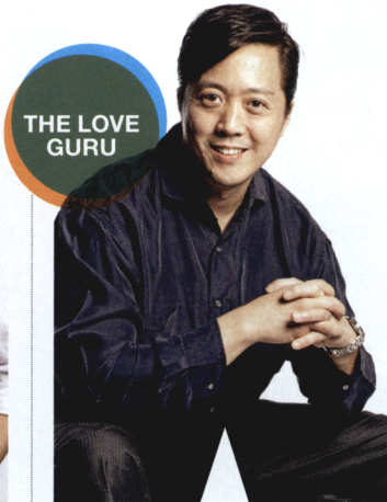
THE LOVE GURU

→ As far as I know, most guys wouldn't complain about an adventurous girlfriend. I think the key would be to pace yourselves, go with the flow and have a laugh. It should not matter if you've been more adventurous than he has, as long as you explore new adventures together. If he asks and you'd rather not lie, just say you don't want to go there; you're here with him now because he is better for you, and a notch over anyone else in the past. So test the waters and see how he responds. If he really is uncomfortable, perhaps you might want to temper your own expectations. At the end of the day, I don't think a woman's sexual past has any bearing on her moral values, as long as she doesn't take it to extremes, such as inflicting injury on you.