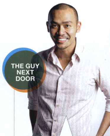
THE GUY NEXT DOOR

Need help finding out what's going on with your guy? E-mail our Manalysts at magherworld@sph.com.sg .