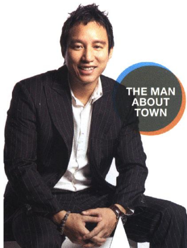
THE MAN ABOUT TOWN

Q: I'm really into this guy and we've been going out casually for two months. He hasn't said anything about getting serious and it's driving me crazy that he introduces me as his "friend". How will I know if he's ready to commit?