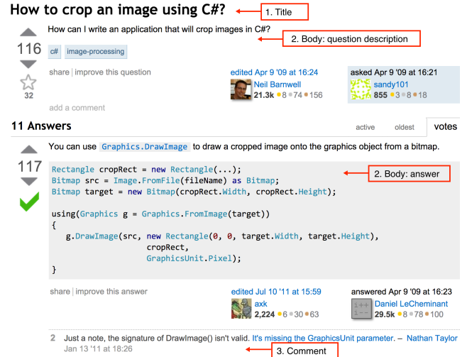
Fig. 2: A sample question-and-answer thread on StackOverflow.